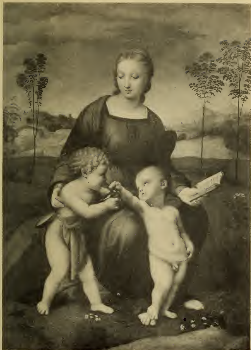
THE MADONNA DEL CARDELLINO (OF THE CHAFFINCH)